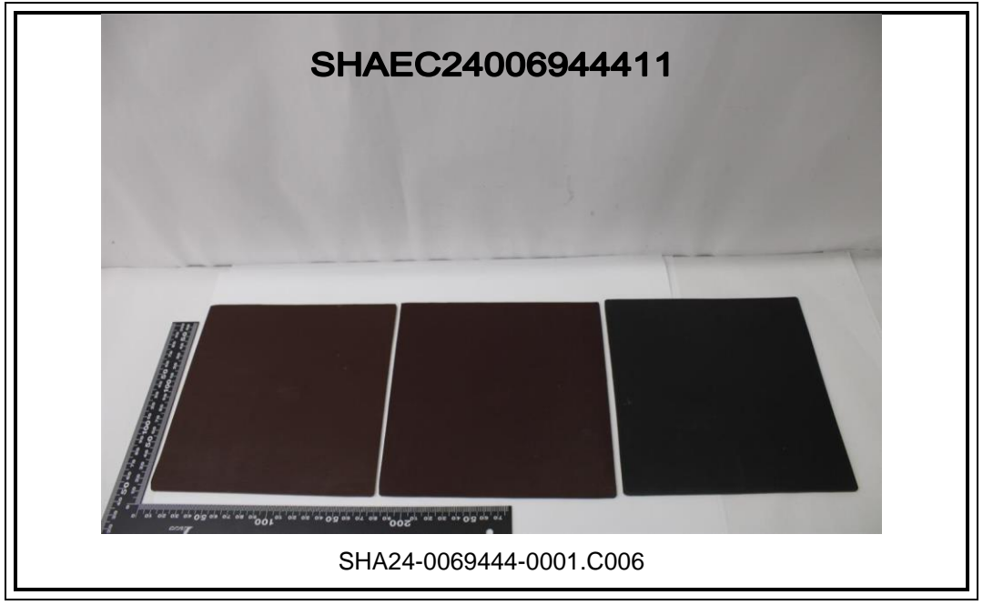
SGS authenticate the photo on original report only *** End of Report ***