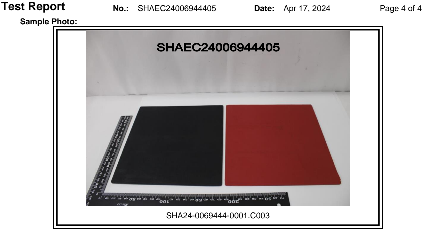
SGS authenticate the photo on original report only *** End of Report ***