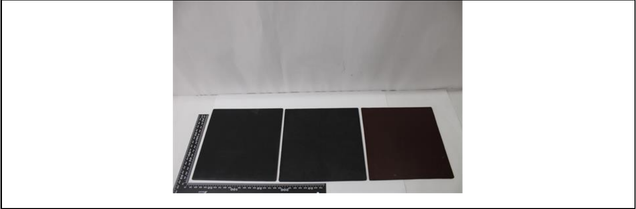
此照片仅限于随 SGS 正本报告使用 ***报告结束***