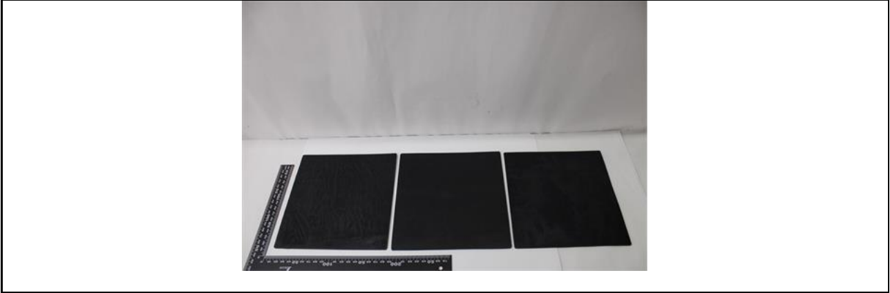
此照片仅限于随 SGS 正本报告使用 ***报告结束***