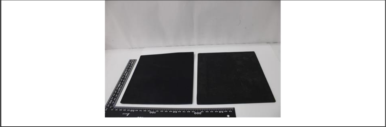
此照片仅限于随 SGS 正本报告使用 ***报告结束***