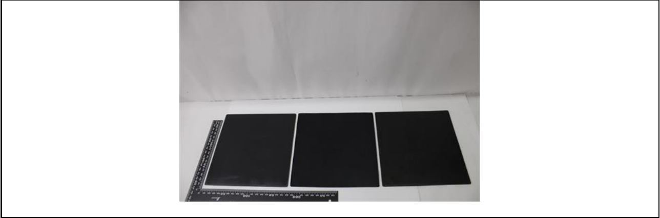
此照片仅限于随 SGS 正本报告使用 ***报告结束***