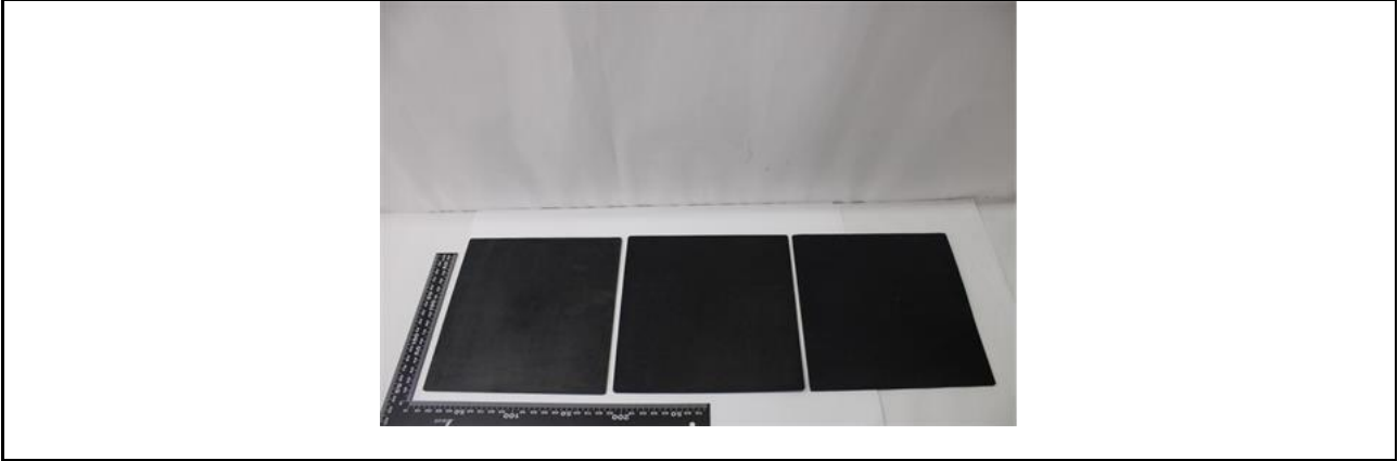
此照片仅限于随 SGS 正本报告使用 ***报告结束***