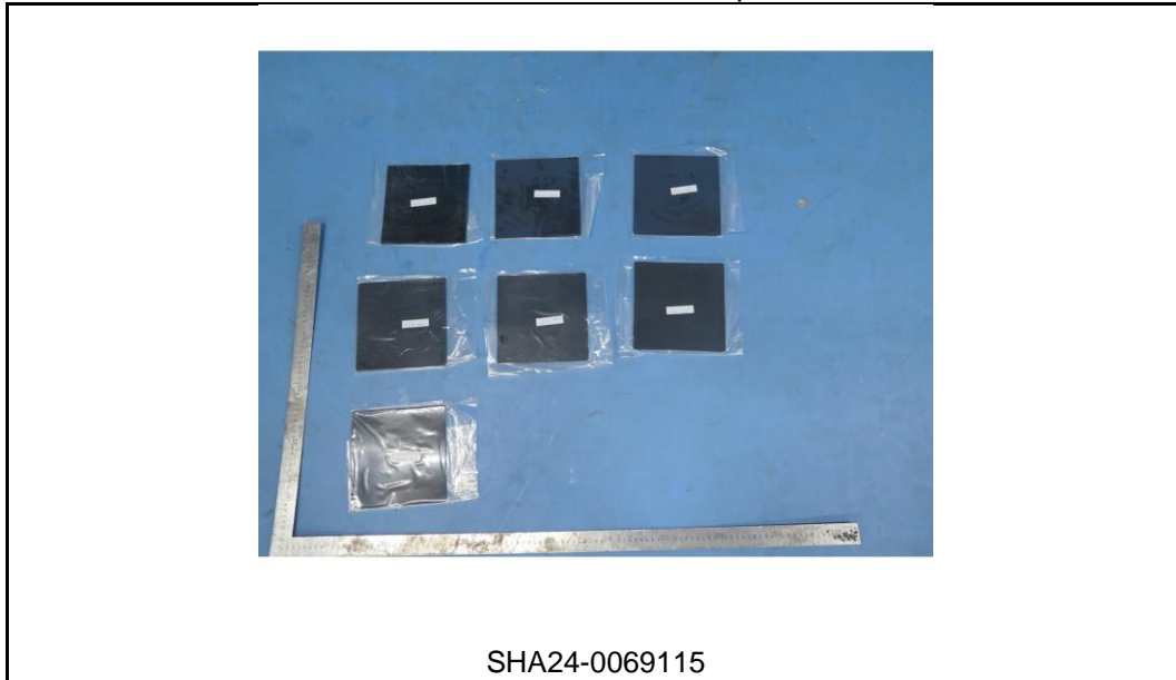
Photo of Submitted Sample

SGS authenticate the photo on original report only